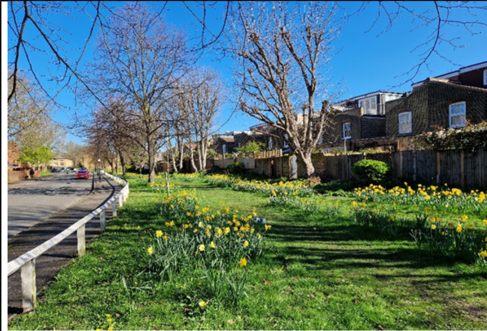
Eg of mowed path through long grass: